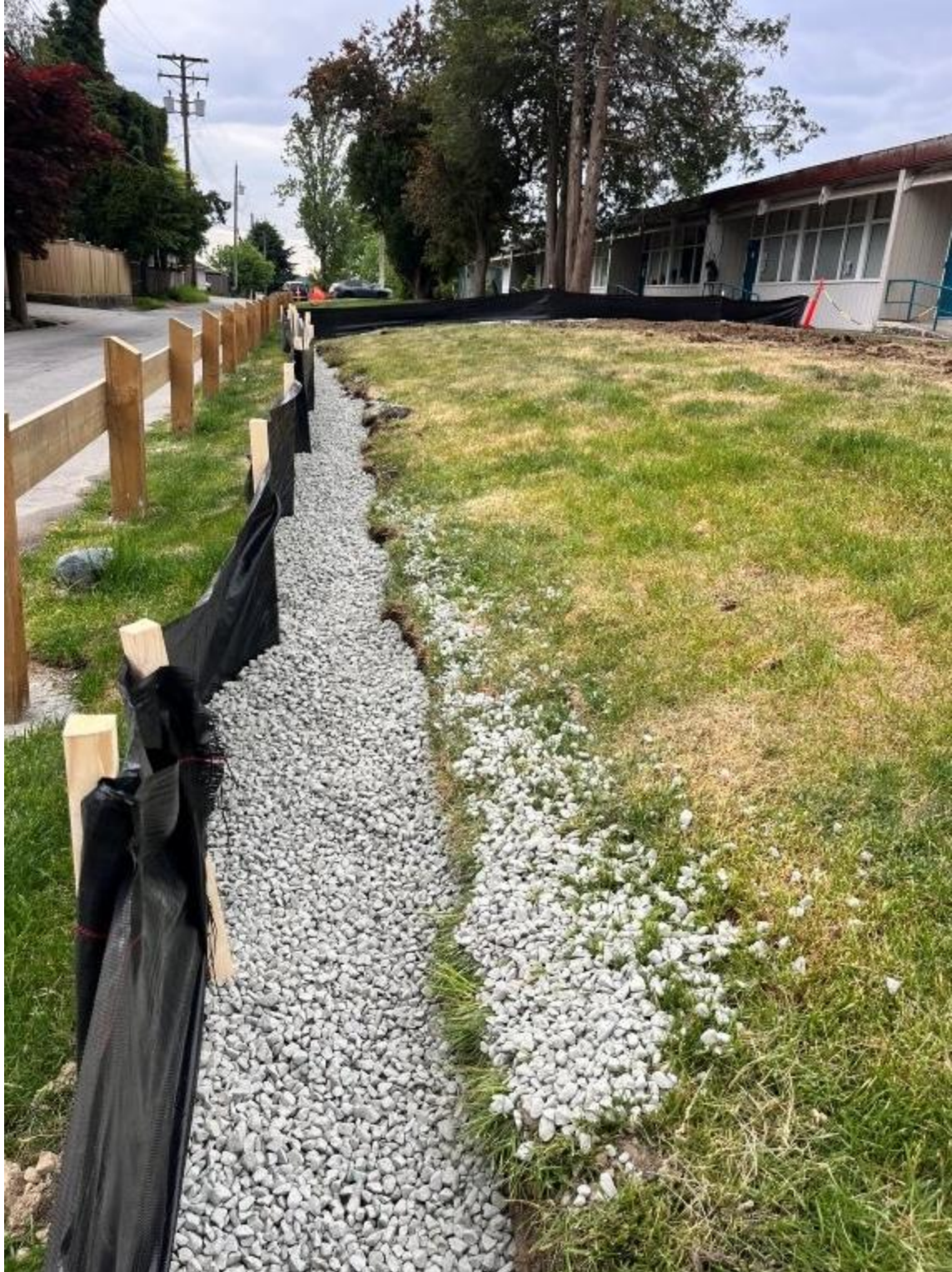
Phase 2 Silt Fence