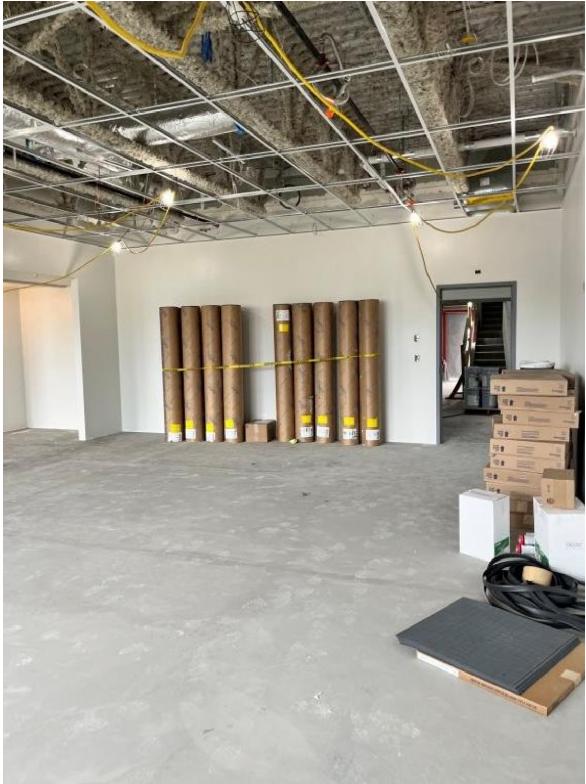
North Addition New Flooring Delivered