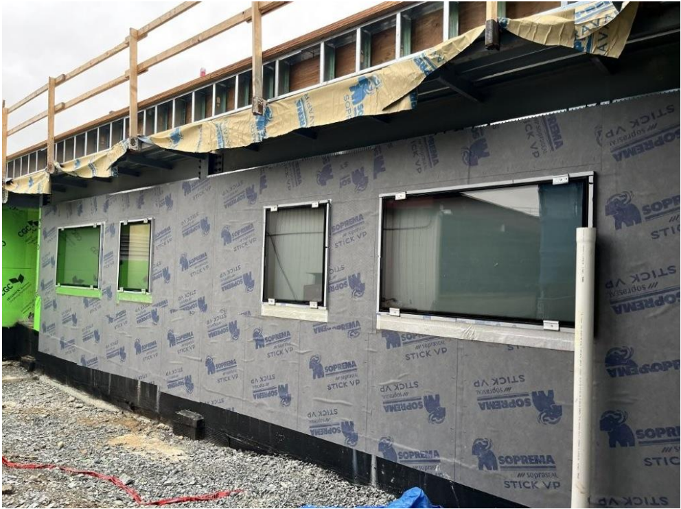
Gym Link Membrane and Glazing