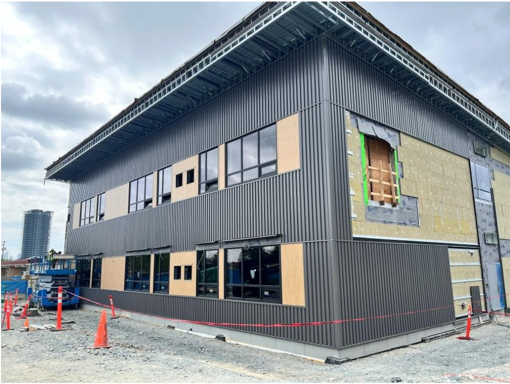
North Addition Cladding Progress