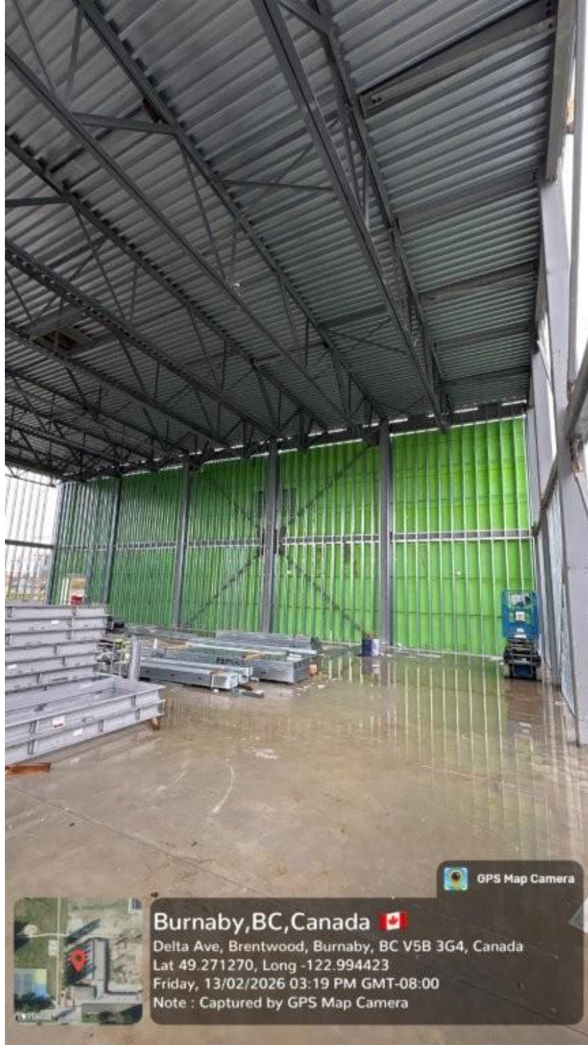
New Gym – West Interior Wall