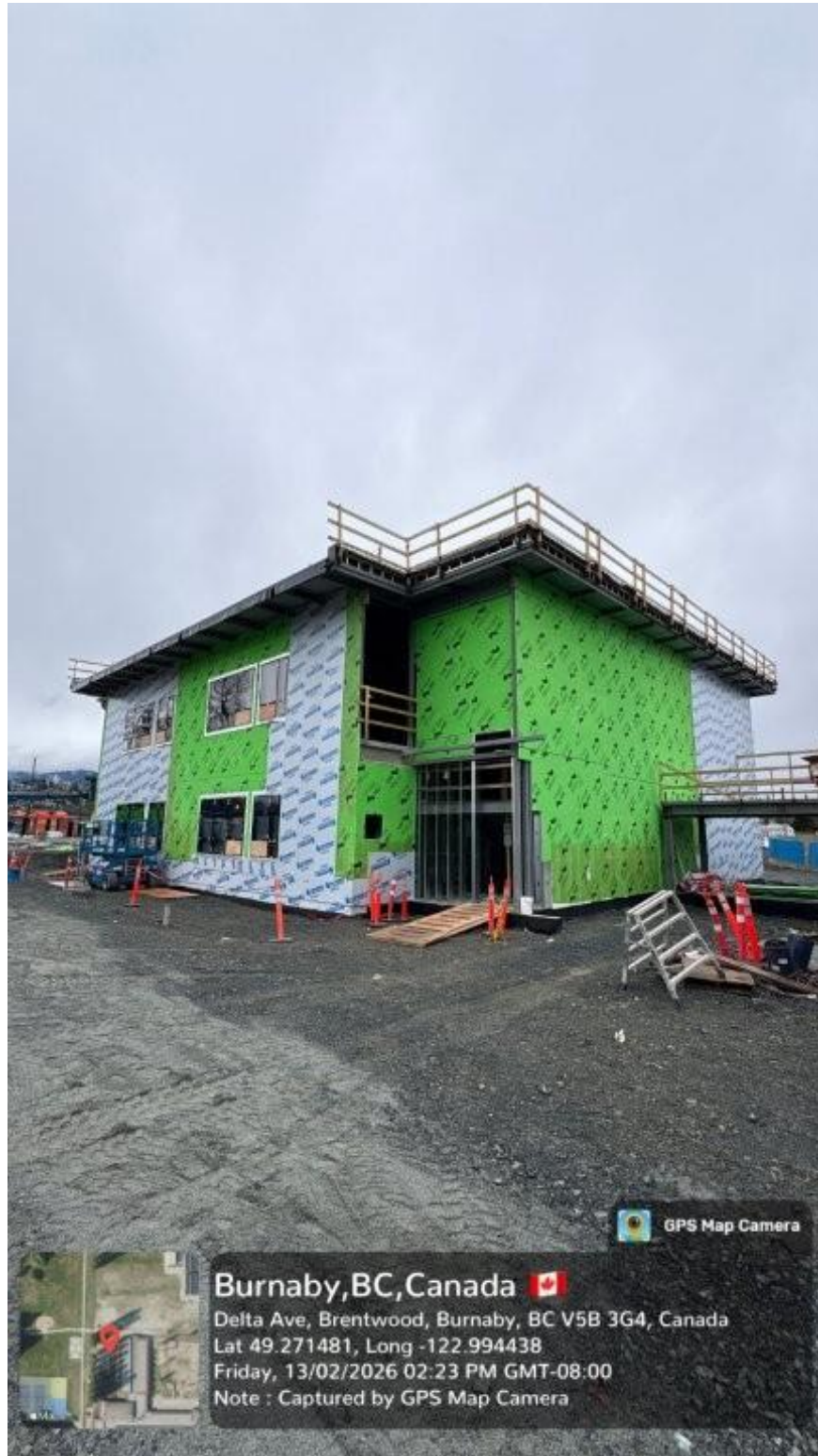
New Classroom Addition – SW Exterior