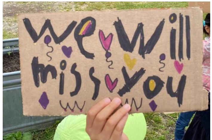
Students shared well-wishes for our Grade 7 students during a parade this week.

At this time, we would like to wish our Grade 7s all the best in their transition to high school. We are so proud of our senior students who have shown much care, responsibility, leadership and community-minded spirit this year.