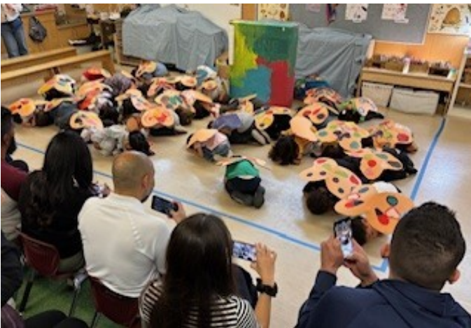
Div. 26 & 27 Kindergarten students sharing about their year in Kindergarten through art, speaking, singing, acting and dancing.

As we reflect on this school year, we would like to take this opportunity to thank our community members for being partners in your child's education. We have so much to be proud of and grateful for at Brentwood Park Elementary School! Our staff have loved seeing family members share in learning and experiences around the school this year, and we look forward to more opportunities next year to work, learn and have fun together.