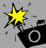
Photo retakes will be the morning of Thursday, November 9th. This time is for absent and new students, and for those who wish to have a RETAKE opportunity.